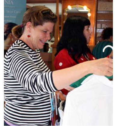
Invited guests "shop" donated clothing items.